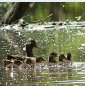
Mallards on the Waccamaw

Our River Sweep at the Conway Marina will take place on Saturday, September 20 from 9am—12pm. Lunch will be provided. Come out and join us at the Conway Marina and help us keep our rivers clean. Please let us know if you have another site you would like to host a cleanup for.