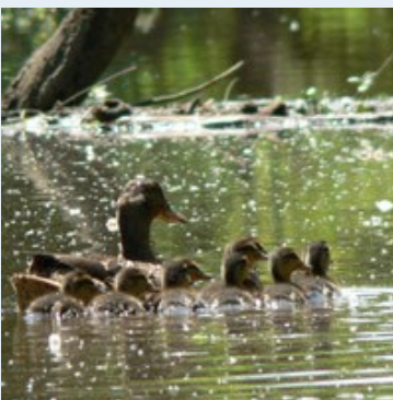
Mallards on the Waccamaw

Our River Sweep at the Conway Marina will take place on Saturday, September 20 from 9am—12pm. Lunch will be provided. Come out and join us at the Conway Marina and help us keep our rivers clean. Please let us know if you have another site you would like to host a cleanup for.