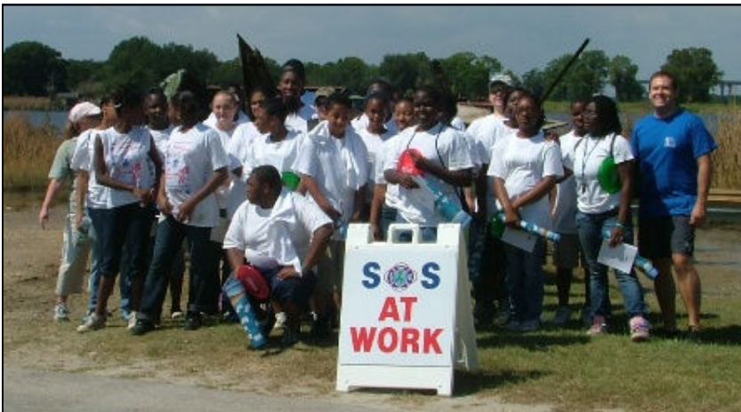
"Youth for a Healthier Sampit River"

Our 2010 agenda is full with a myriad of projects throughout the greater Winyah Bay watershed. If you haven't already checked out our website, it's time to do so to stay abreast of all of these projects. In Georgetown, we're proud of our year long project engaging the youth volunteers of Service Over Self in watershed stewardship. The project kicked off in September 2009, partnering with the folks at Keep Georgetown Beautiful to help clean up the Sampit River during South Carolina's official Beach Sweep River Sweep event. The participating youth came up with a name "Youth for a Healthier Sampit River" and a logo to use during this year long project. Interested in getting involved in this watershed stewardship project? Call me.