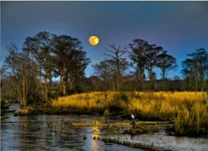
MARSH MOON

Our third annual photo contest was a wonderful success, thanks in part to the continued commitment of our founding sponsors "The Horry Independent" and "803 Labs" of Myrtle Beach. We are so pleased that the Franklin G. Burroughs - Simeon B. Chapin Art Museum welcomed us back to exhibit this year's winning photos. The awards ceremony held May 7 at the museum was well attended. Our contestants and guests enjoyed a wonderful array of appetizers provided by our newest sponsor for this event, "Fatz Café" of Conway. The tables were complimented by beautiful flower arrangements provided by "Master Gardeners", and with stemware and linens provided by SpringMaid Beach Resort. A "People's Choice" contest was held that evening and the winner was??? Please visit our website to see that winning photo and the other 2010 winners.