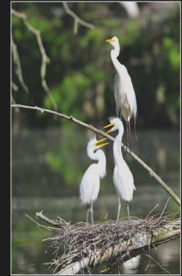
"Mama and Children Egrets" BEST OF SHOW

PROMOTING THE BEAUTY OF THE WINYAH RIVERS OPEN TO ALL! ENTER OFTEN! PRIZES TO BE AWARDED! DEADLINE FOR ENTRIES JULY 1, 2009