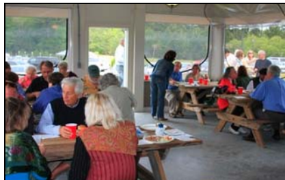
Members of Winyah Rivers Foundation at our Annual Meeting at Osprey Marina