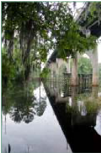
Echoed Beauty by Whitney Simbeck