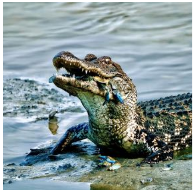
Wildlife 1st Place "Blue Crab Special" Bronnie Fisher