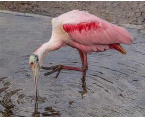
Best In Show "Big Itch" Anthony Morano