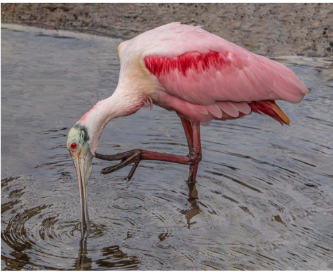
Best In Show "Big Itch" Anthony Morano