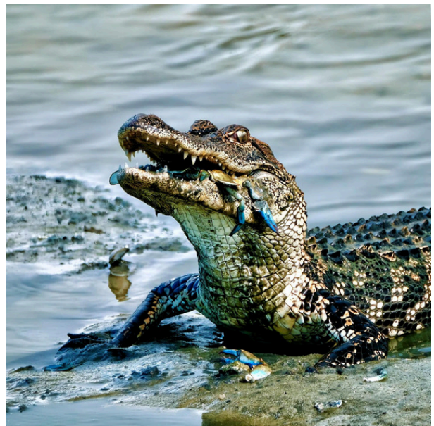
Wildlife 1st Place "Blue Crab Special" Bronnie Fisher